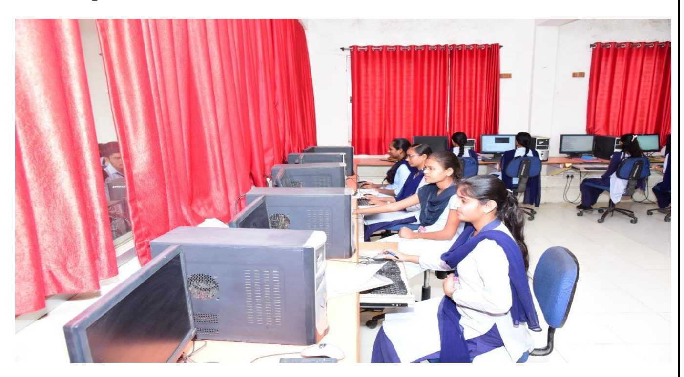
❖ Language Lab